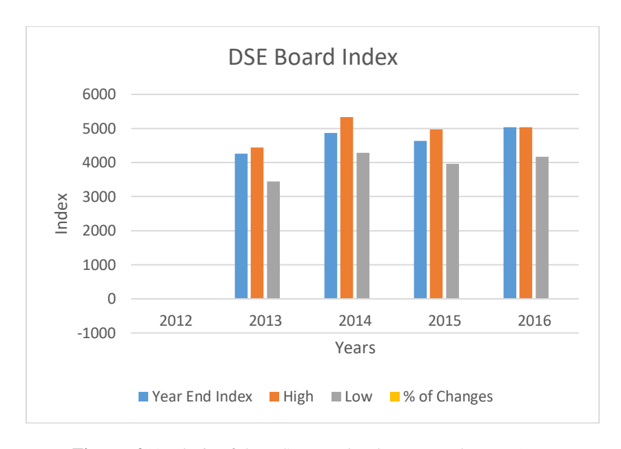
Figure: 2(Analysis of the DSE Board Indexes over the years)